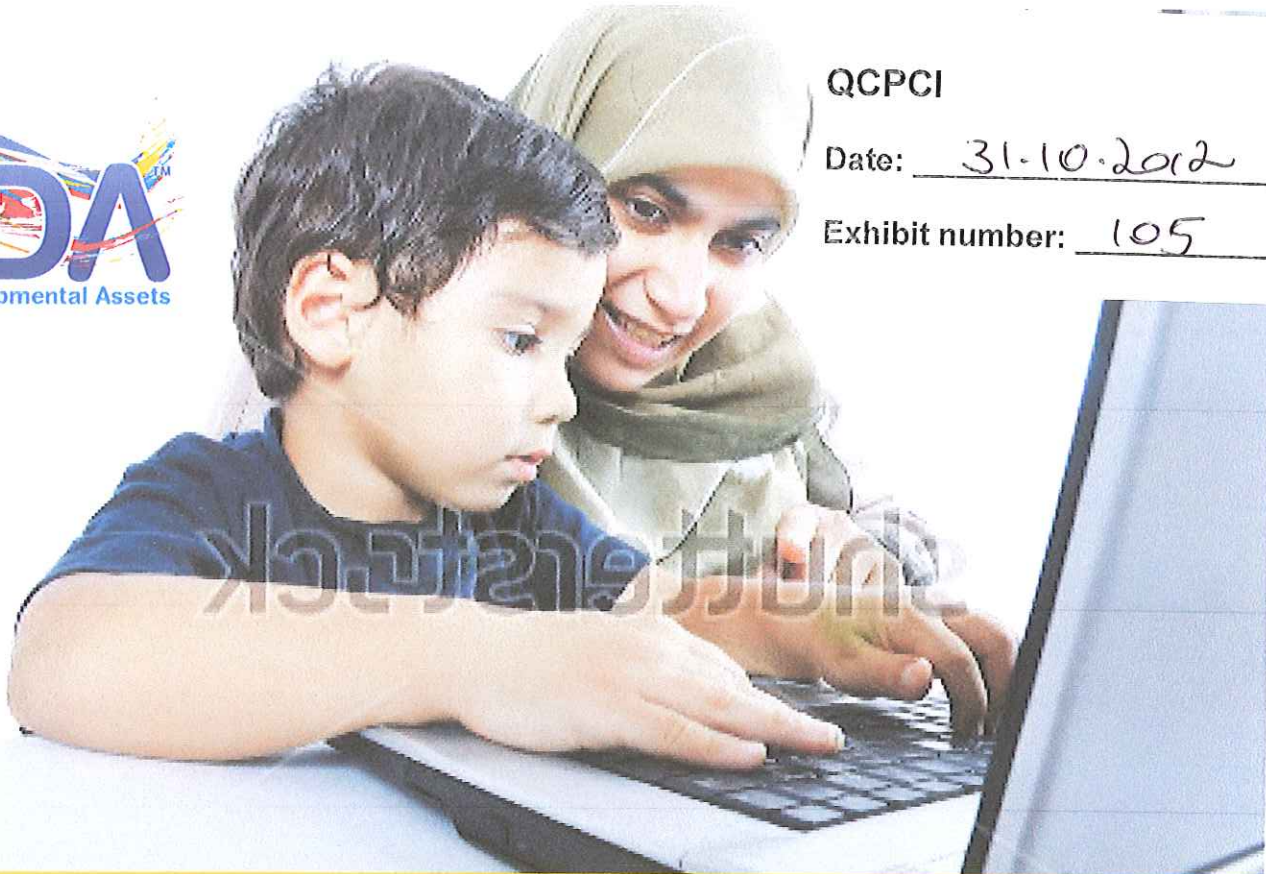
Exhibit number: 105